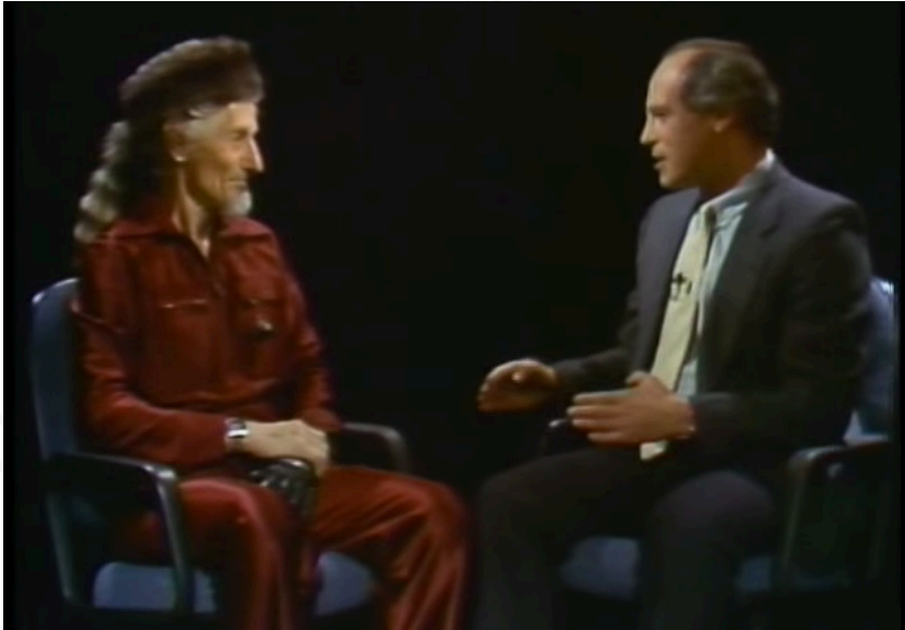
The Lilly-Mishlove interview - Thinking Allowed DVD - www.thinkingallowed.com - "From Here to Altermity"